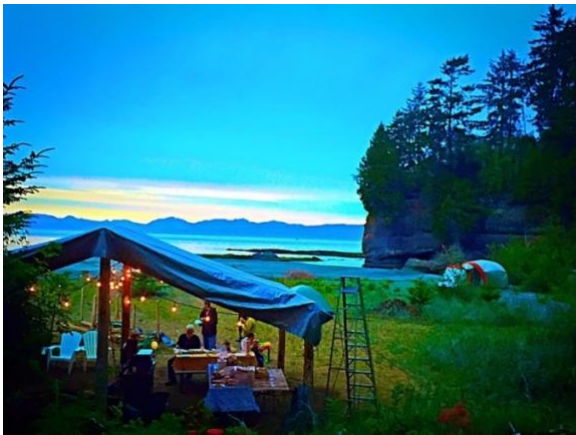
Our lit-up and covered firepit area for dinners at the Hoko River Mouth Retreat