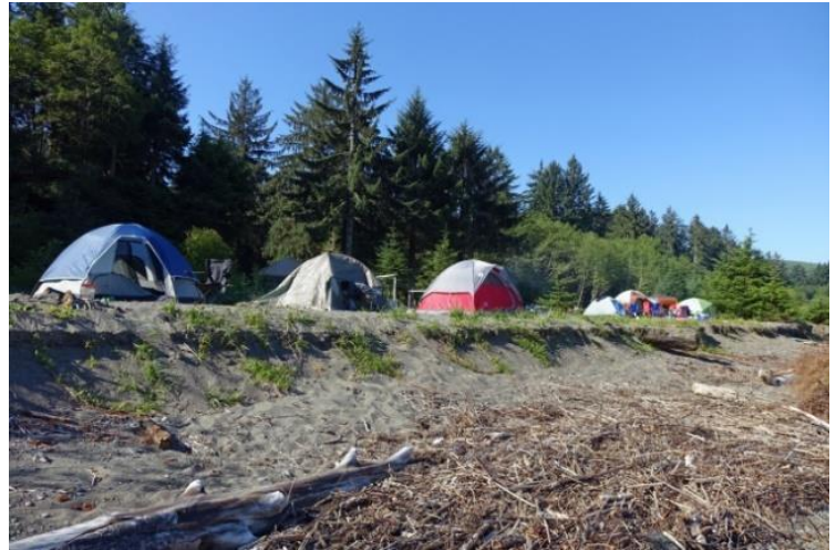
Camping on Hoko River Mouth Retreat Beach. Camping cabins also available.