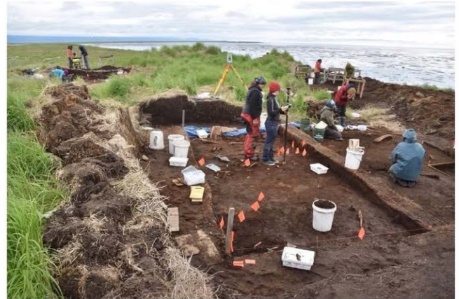
The Nunalleq Archaeological Site in 2024

PNWAS has raised over $13,500.00 for the project, and Rick indicated in his recent update that they now can support a volunteer crew to return after the thaw and he expects they will recover over 5,000 more wood/fiber perishables artifacts at that time. He also indicated that he will update us with a PNWAS ZOOM talk on the results in the Fall of 2026. DO DONATE—ANY AMOUNT HELPS OUR COMMUNITY EFFORT!!!