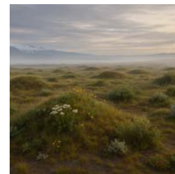
(Left) mima mounds in today's Black Lake valley with paths for visitors; Mammoth and Bison move in lines and could be ambushed from behind these ~6' high mounds; (Right) reconstructed tundra grassland mima mound ice age environment.

We envision that First Peoples/Early Squaxins could use the pathways through the vast mima mounds to ambush mammoth, bison and other late Pleistocene megafauna using atlatl/spear throwers, as commonly thought used with Clovis-like points at this early time.