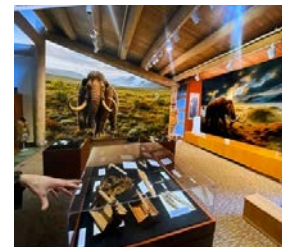
Mock up of how the Squaxin Museum Mammoth Exhibit will appear in the museum. The mammoth bones will be in the covered cases and the weaponry (atlatl, clovis point replicas, touch screens for story of Chehalis River Hypothesis, etc. will be on shelf to right.