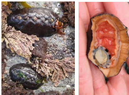
Black Katy Chitons, from top and underside; an amazing food source and important animal in stories of Northwest Coast Peoples

For the past 10 years I have been studying and publishing on the importance of chitons as a food source and in the oral history of Northwest Coast Peoples. As a food the western world rarely eats, we tend to ignore their considerable importance in the archaeological shell middens from the earliest periods on the entire Pacific NW Coast (see endowed chiton maps of sites of importance to this presentation).