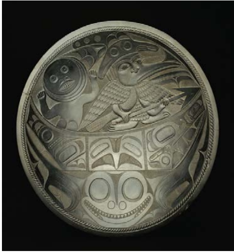
Charles Edenshaw (attr.) Seattle Art Museum argillite platter (one of three, and c. 1885; 32.9 x 5.7 cm) depicting Raven with spear hunting Twas , a combination of chiton and female genitalia. As steersman, bracken fungus man, galaga snaanga, is freaked out and/or stimulated as they confront the power of Twas , depicted as a spirit-like power under the canoe, on the

Therefore, on a very super-structural level, we continue to see chitons playing a key role in the actual existence of people and their ability to continue themselves and their cultural developments in this world (see one of his argillite platters, below).