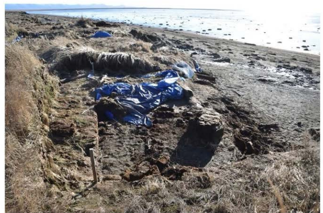
Same location after the Typhoon of October 2025